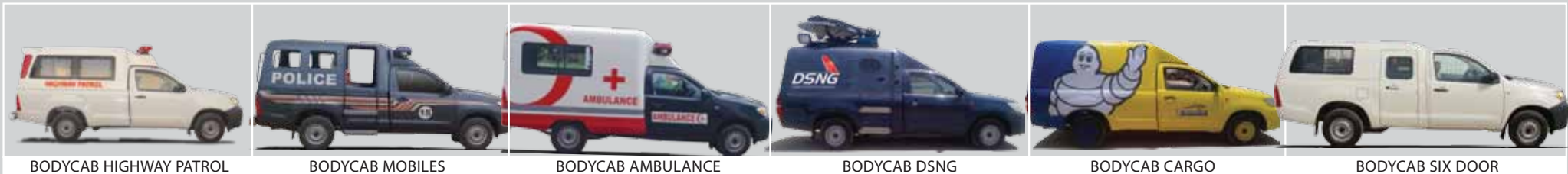
BODYCAB HIGHWAY PATROL